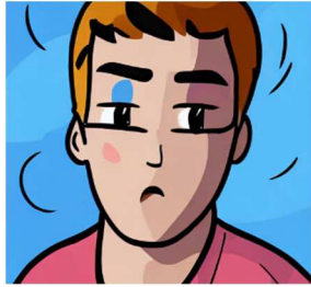
Just a test!

Read and answer the questions. Choose A, B or C